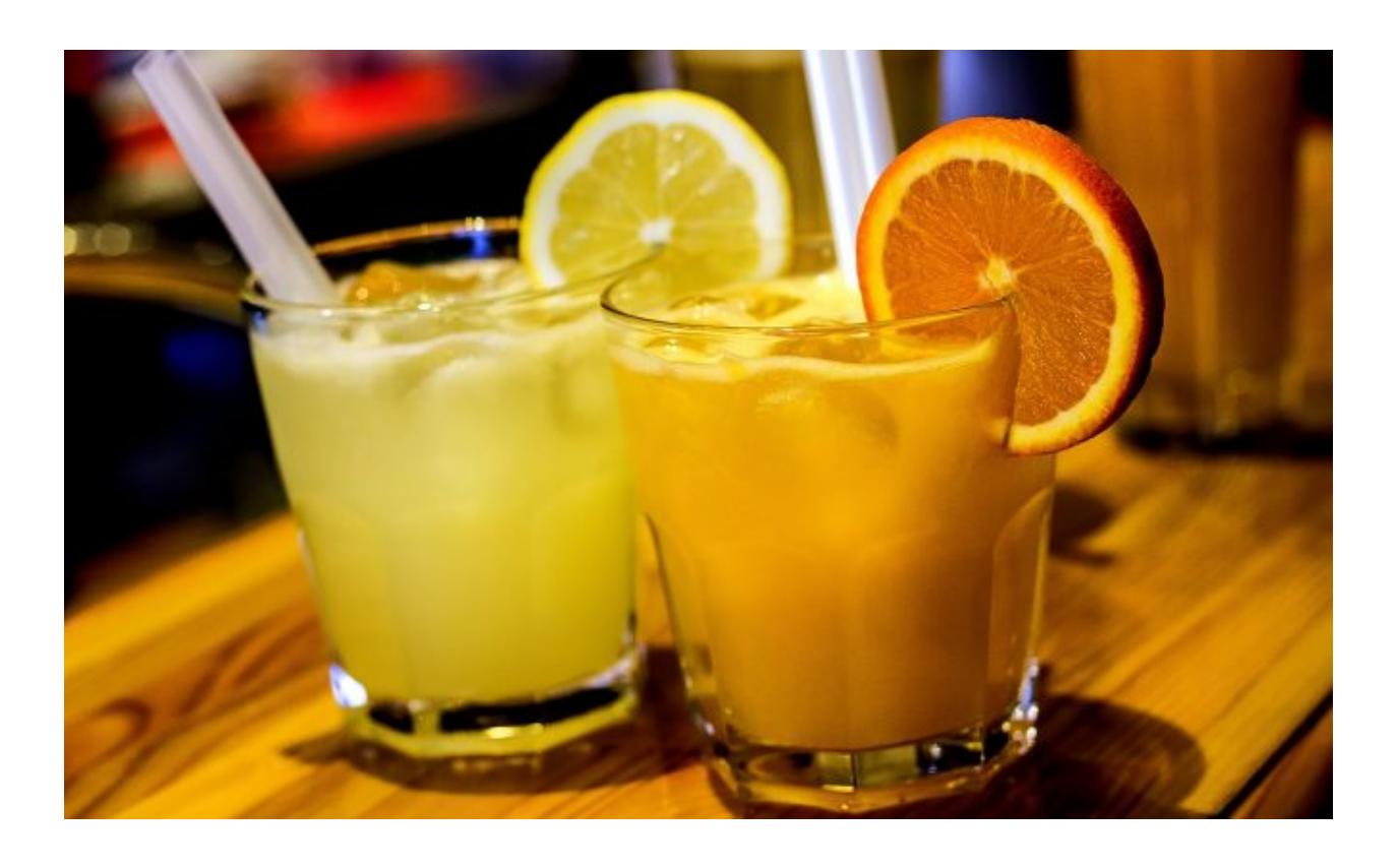
Top Trivia Spots in San Diego